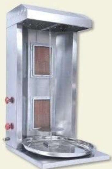
SHAWARMA TABLE TOP