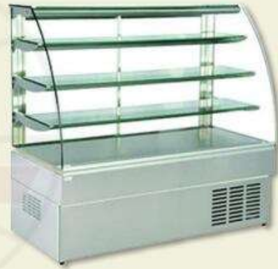
CURVE DISPLAY COUNTER