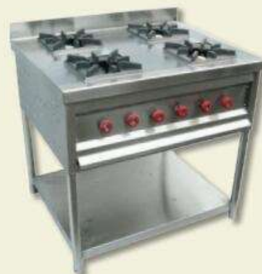
CONTINENTAL GAS RANGE