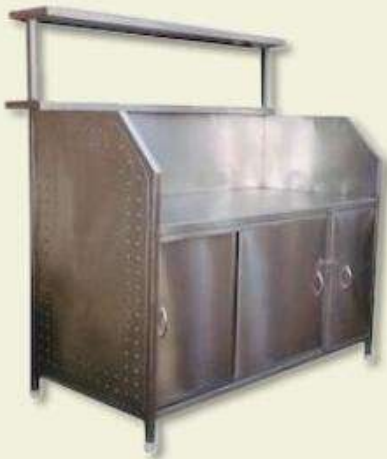
PAV BHAJI COUNTER