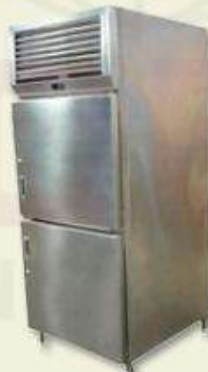
TWO DOOR VERTICAL FREEZER