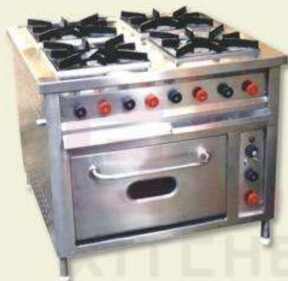
CONTINENTAL GAS RANGE WITH OVEN