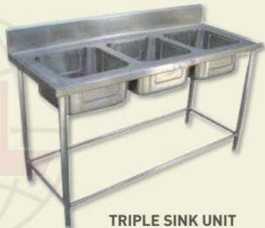
TRIPLE SINK UNIT