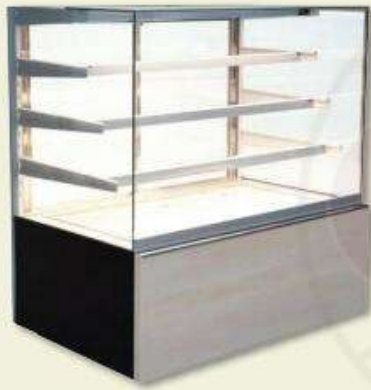
BOX DISPLAY COUNTER