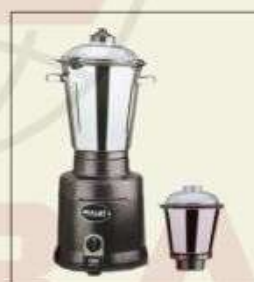
HEAVY DUTY MIXER