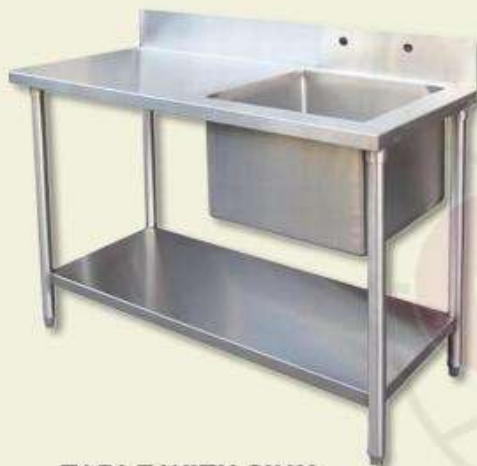
TABLE WITH SINK