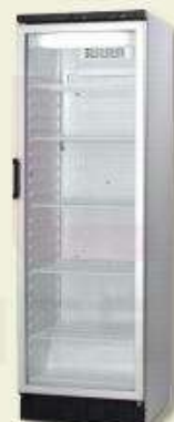
GLASS DOOR REFRIGERATOR