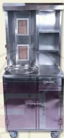
SHAWARMA FULL CABINET