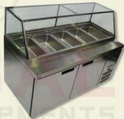
BAIN MARIE COUNTER