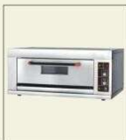
SINGLE DECK OVEN