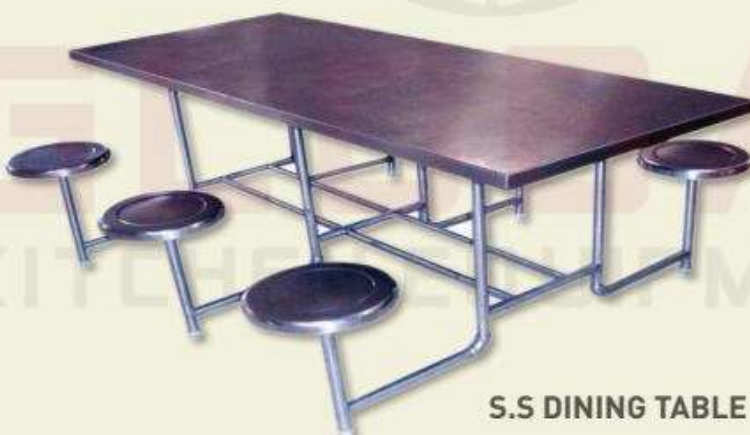
S.S. DINING TABLE