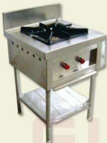
INDIAN SINGLE BURNER