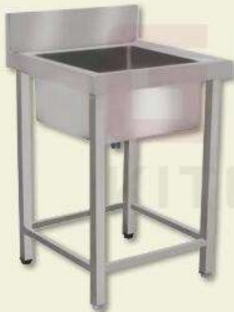
SINGLE SINK UNIT