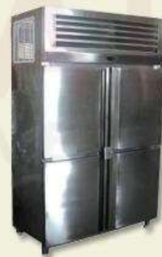
FOUR DOOR VERTICAL FREEZER