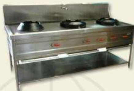
CHINESE TRIPLE BURNER