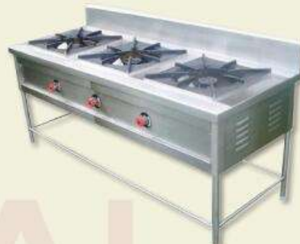
INDIAN TRIPLE BURNER