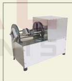
FRENCH FRY CUTTER