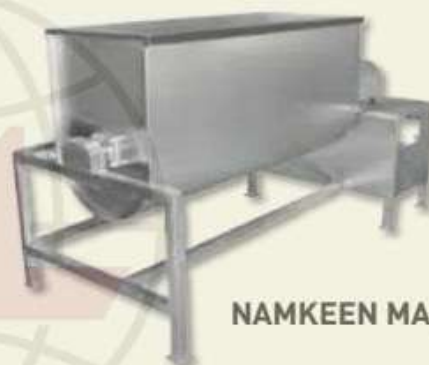
NAMKEEN MASALA MIXER