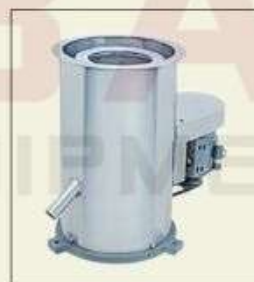
OIL DRYING MACHINE