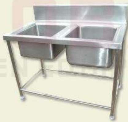
DOUBLE SINK UNIT