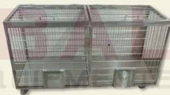
POTATO ONION BIN