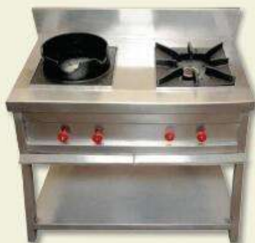
DOUBLE BURNER (CHINESE + INDIAN)