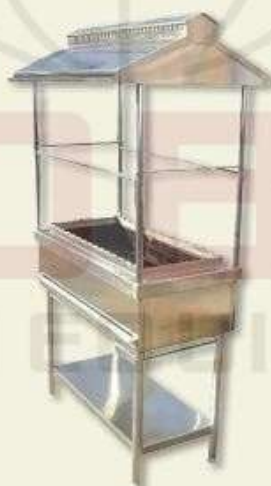
BARBECUE WITH STAND