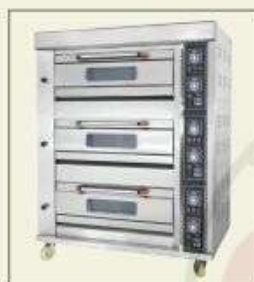
TRIPLE DECK OVEN