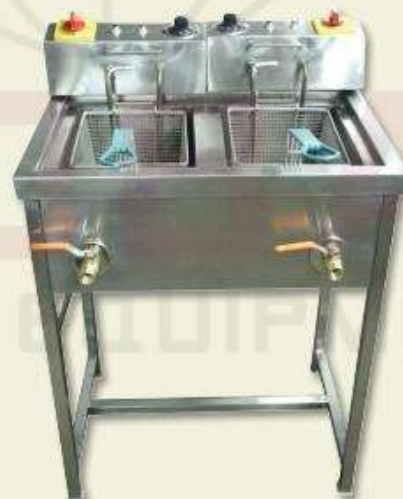
DOUBLE DEEP FRYER