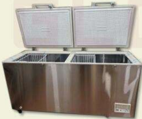
CHEST DOOR FREEZER