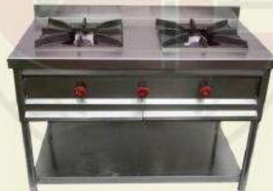
INDIAN DOUBLE BURNER